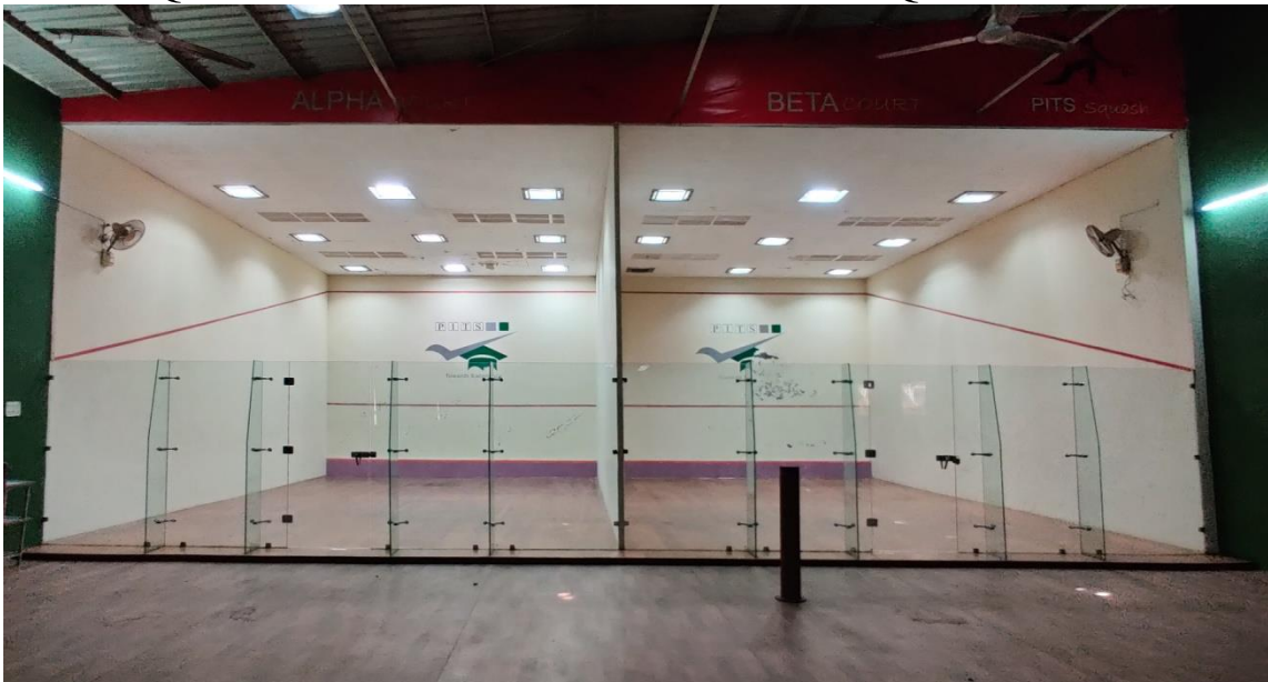
BOYS SQUASH COURT